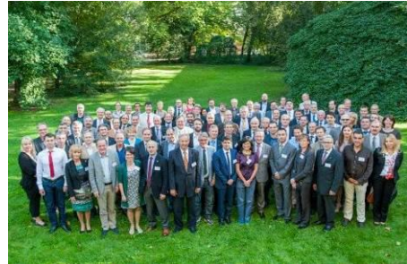
EFI Annual Conference 2013 group photo by ©INRA/Ch. Maitre

See: http://www.efi.int/portal/efi20years/ac2013/