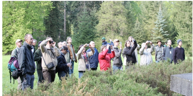
Picture: EFICEEC excursion

We thank all participants for their dedication and active participation and give a big hug to our local organisers from Mendel University in Brno!