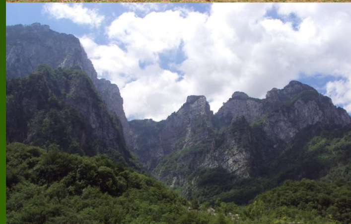
Nature and biodiversity protection