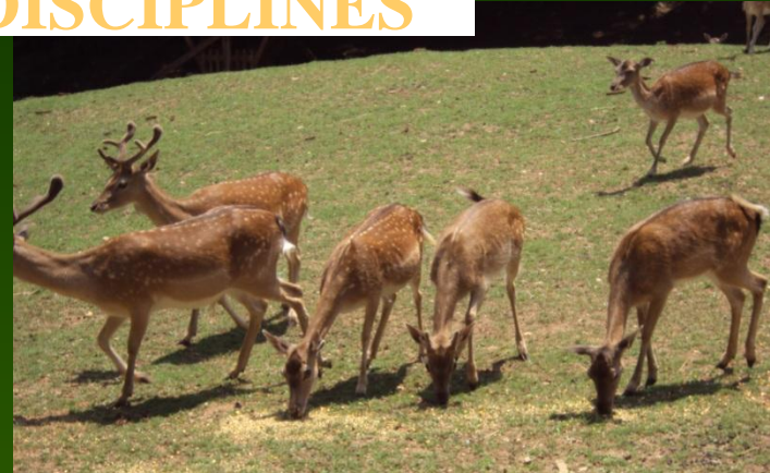
Wildlife protection and hunting